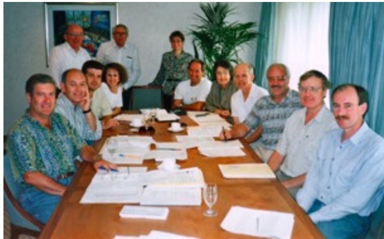
Meeting SEAANZ Executive in Sydney in 1992