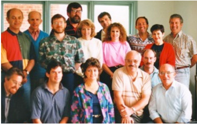
Meeting SEAANZ Executive in Melbourne in 1991