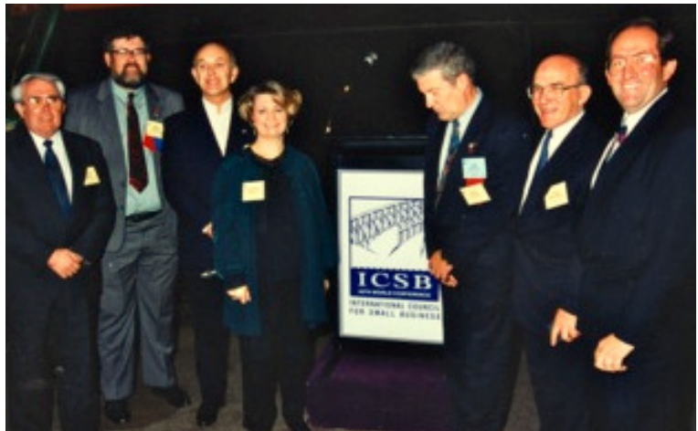
Opening ceremony ICSB 40th World Conference, Sydney, 1995